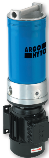
Oil service unit FNA 008/016