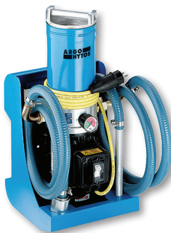
Filling unit FA 016

The efficiency of the EXAPOR®AQUA can be analyzed on-site. As long as a turbidity is visible in the cooled down oil, the water content is, in most cases, unacceptably high. If the cooled down oil sample appears clear, the water content usually lies in the permissible range. An exact measurement of the water content is made by an oil sample analysis in the laboratory (e.g. water content regulation after the Karl Fischer method in accordance with DIN 51777).